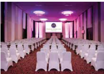
Son Tra Grand Ballroom